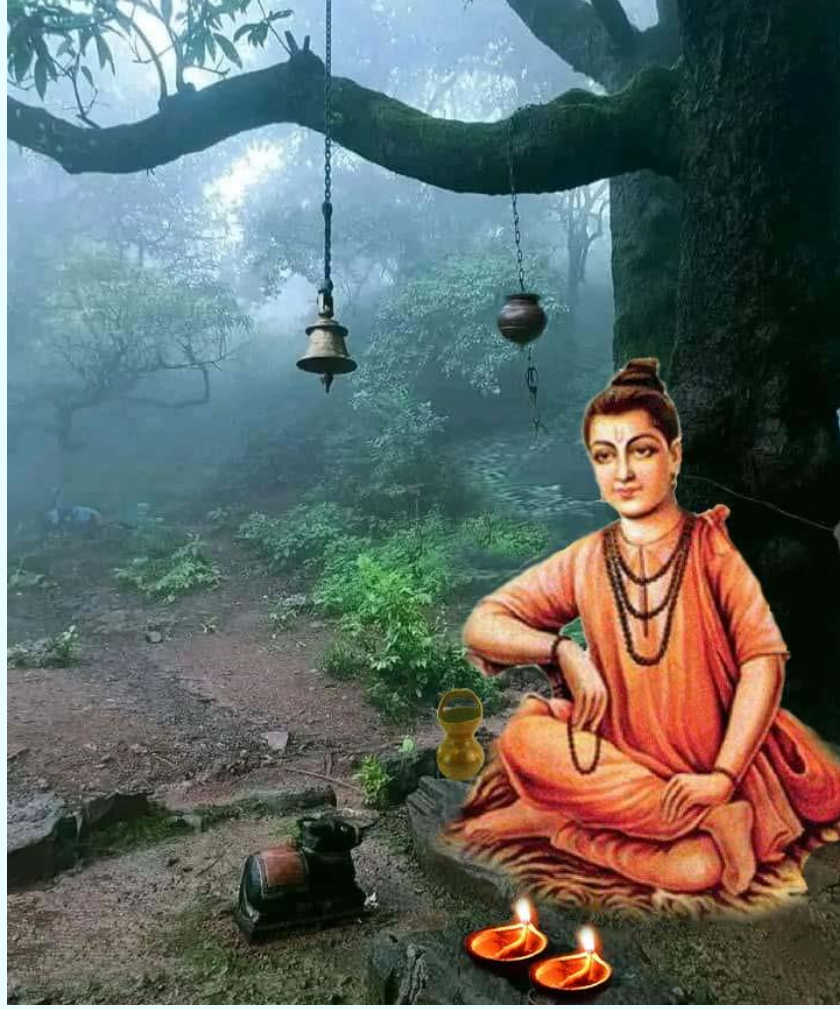
Digambara Datta Digambara Sripada Vallabha Digambara